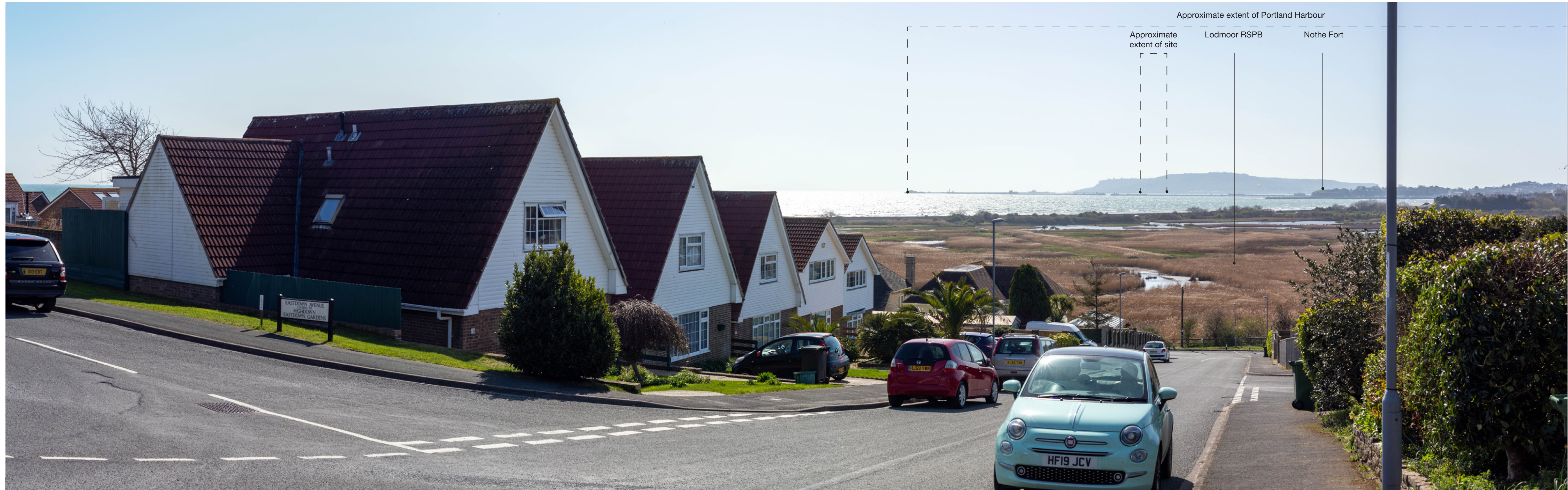
Taken from Hazeldown Avenue adjacent to Eastdown Avenue Visualisation type 1. To be viewed at a comfortable arm's length and printed at A1