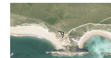
Figure 9.31 Viewpoint 14 winter