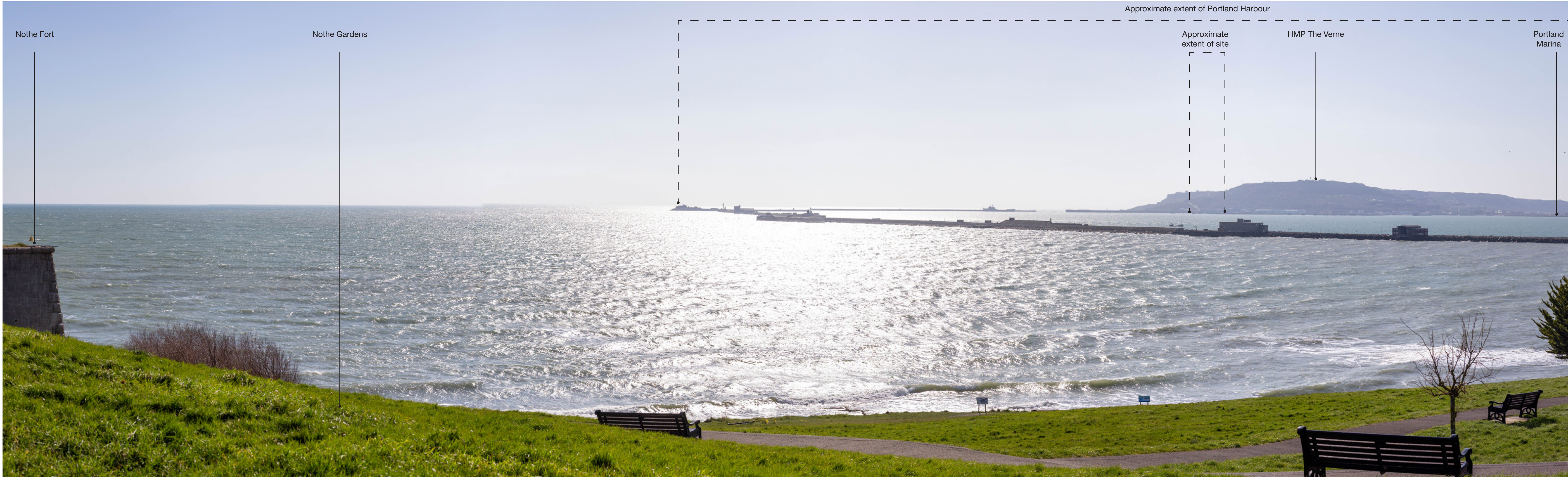
Taken from Nothe Fort gardens Visualisation type 1. To be viewed at a comfortable arm's length and printed at A1