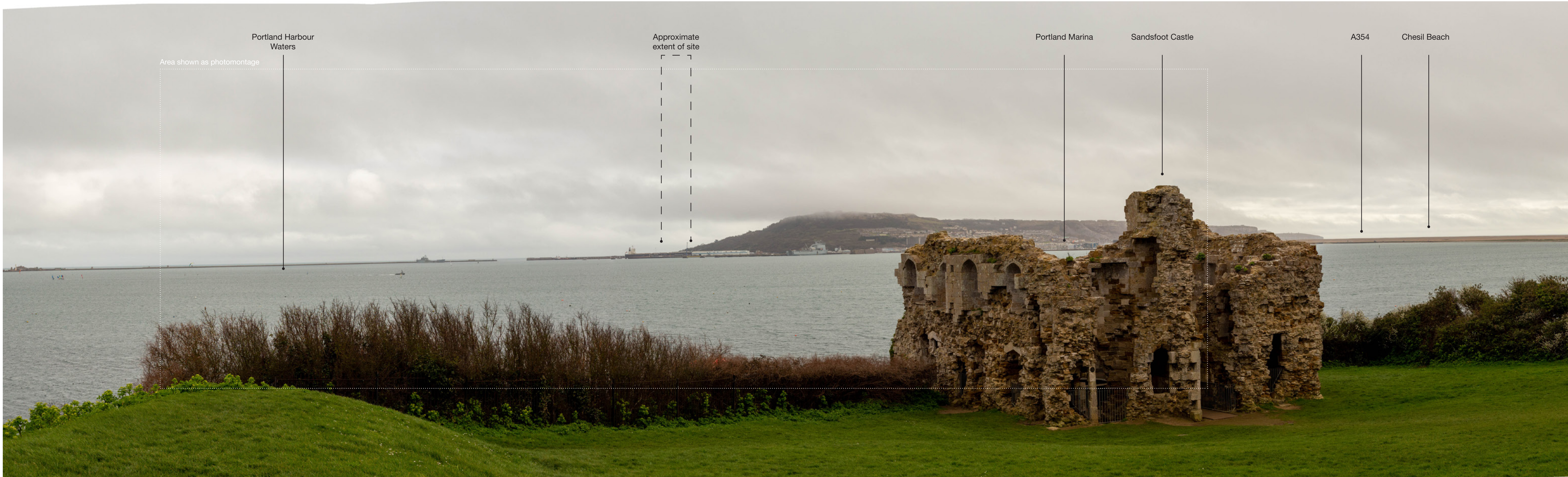
Taken from Sandsfoot Castle Visualisation type 1. To be viewed at a comfortable arm's length and printed at A1