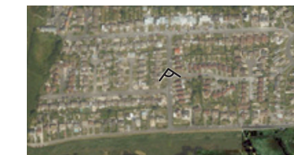
Figure 9.21 Viewpoint 4 winter