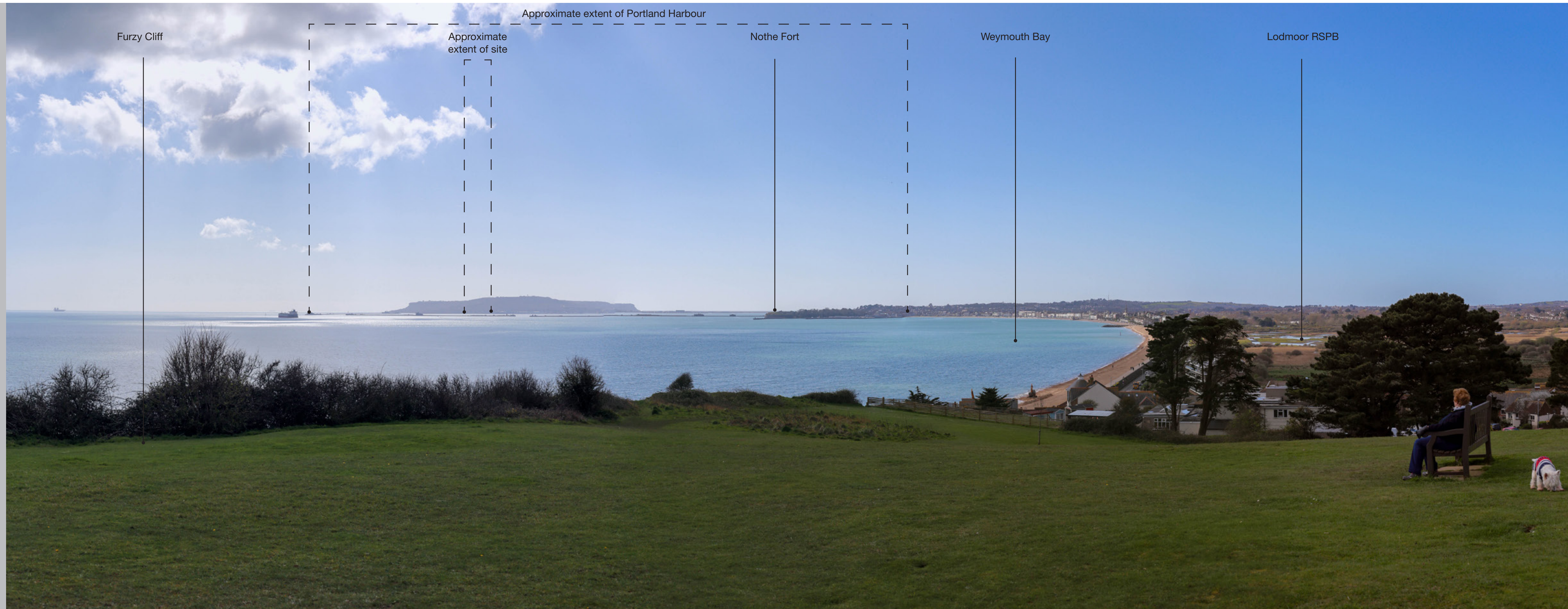
Taken from Furzy Cliff, Overcombe Visualisation type 1. To be viewed at a comfortable arm's length and printed at A1