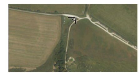
Figure 9.29 Viewpoint 12 winter