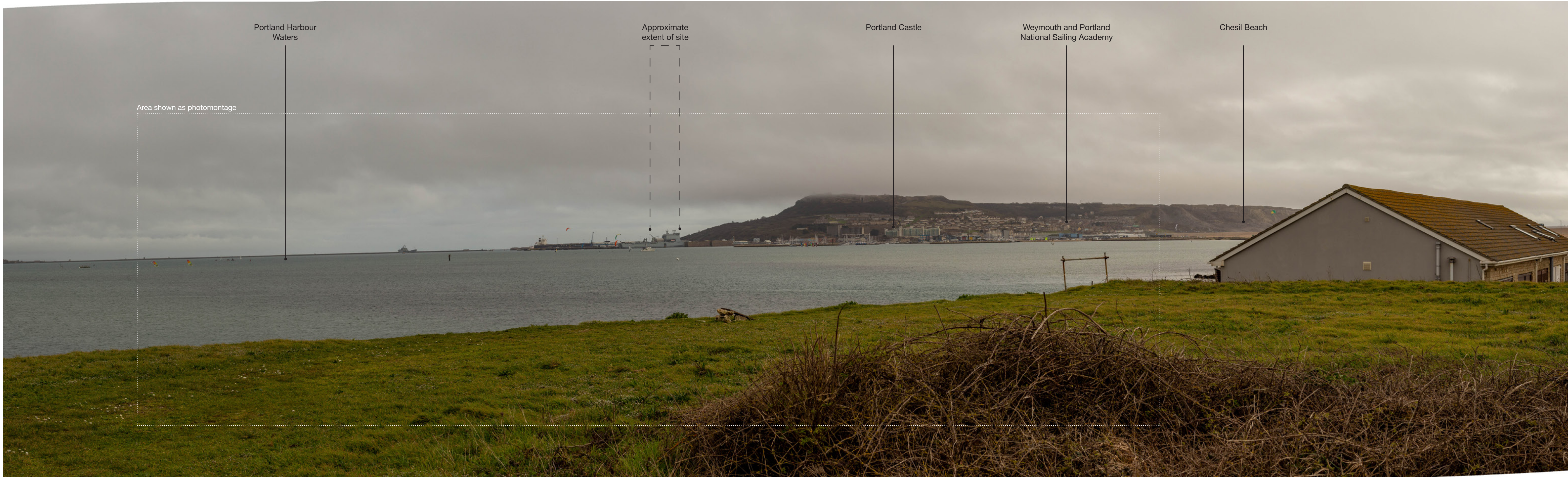
Taken from Ferry Bridge by Fishermans Quay Visualisation type 1. To be viewed at a comfortable arm's length and printed at A1