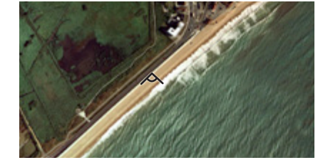
Figure 9.23 Viewpoint 6 winter