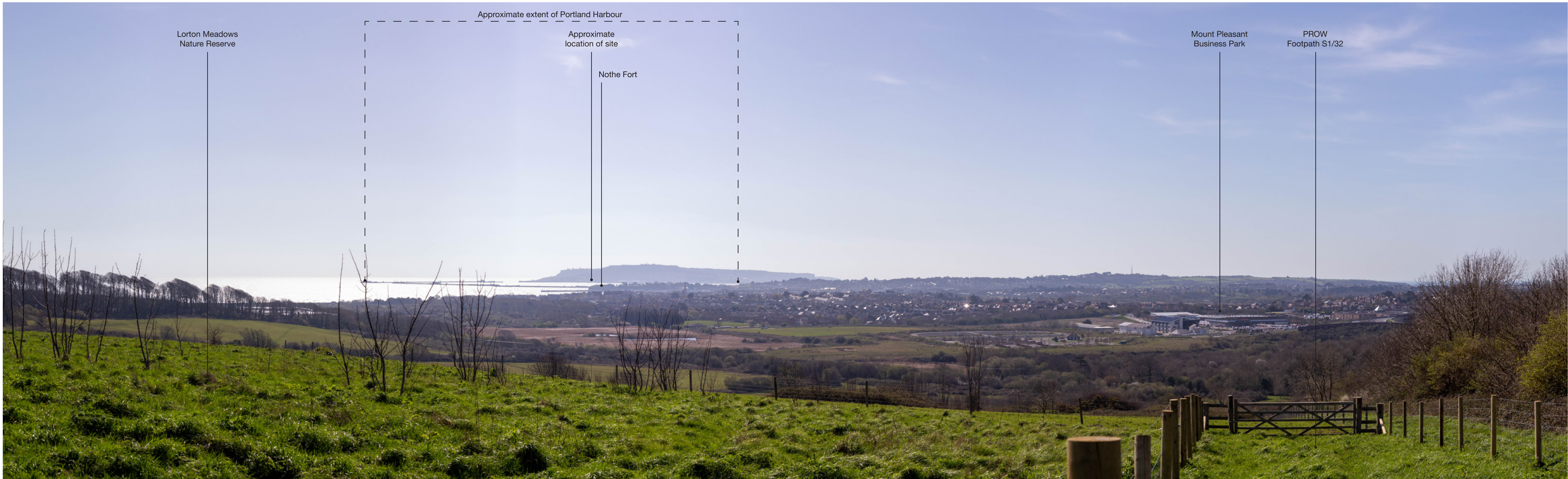
Taken from bridleway S1/21 Visualisation type 1. To be viewed at a comfortable arm's length and printed at A1