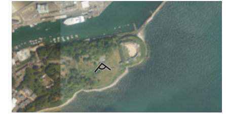
Figure 9.27 Viewpoint 10 winter