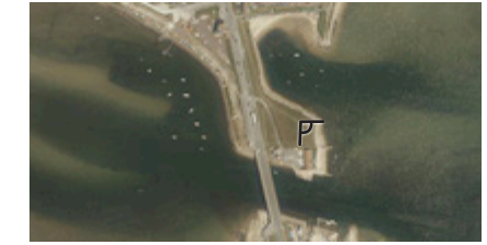
Figure 9.25 Viewpoint 8 winter