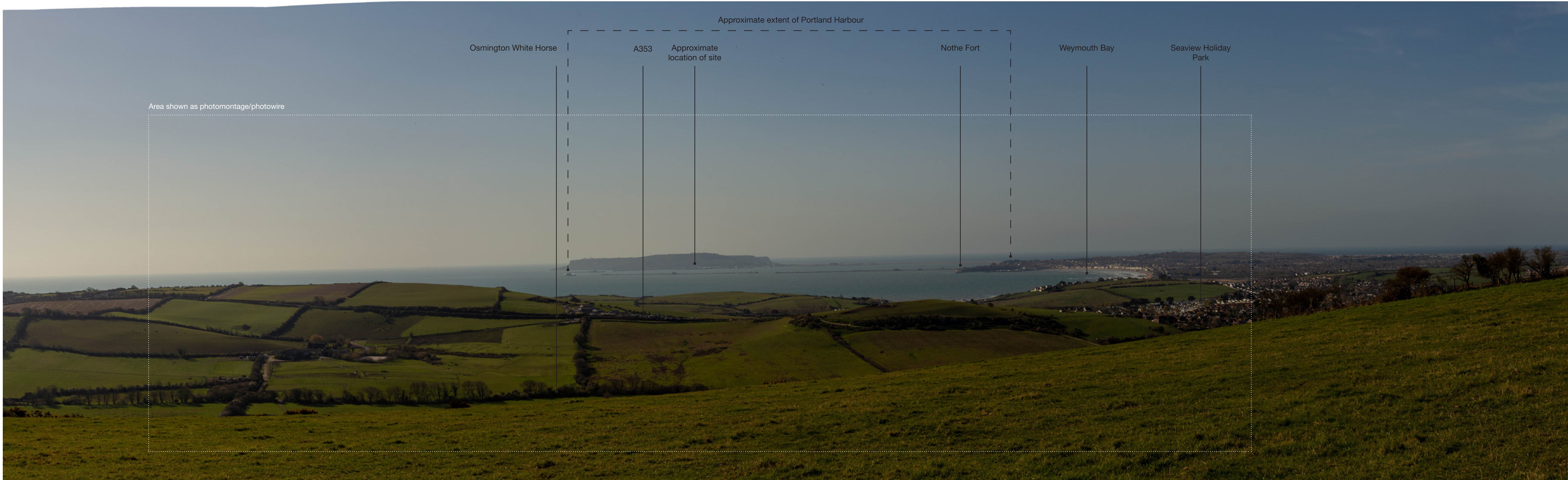
Taken from White Horse Hill Visualisation type 1. To be viewed at a comfortable arm's length and printed at A1