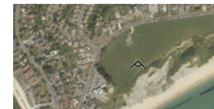
Figure 9.22 Viewpoint 5 winter