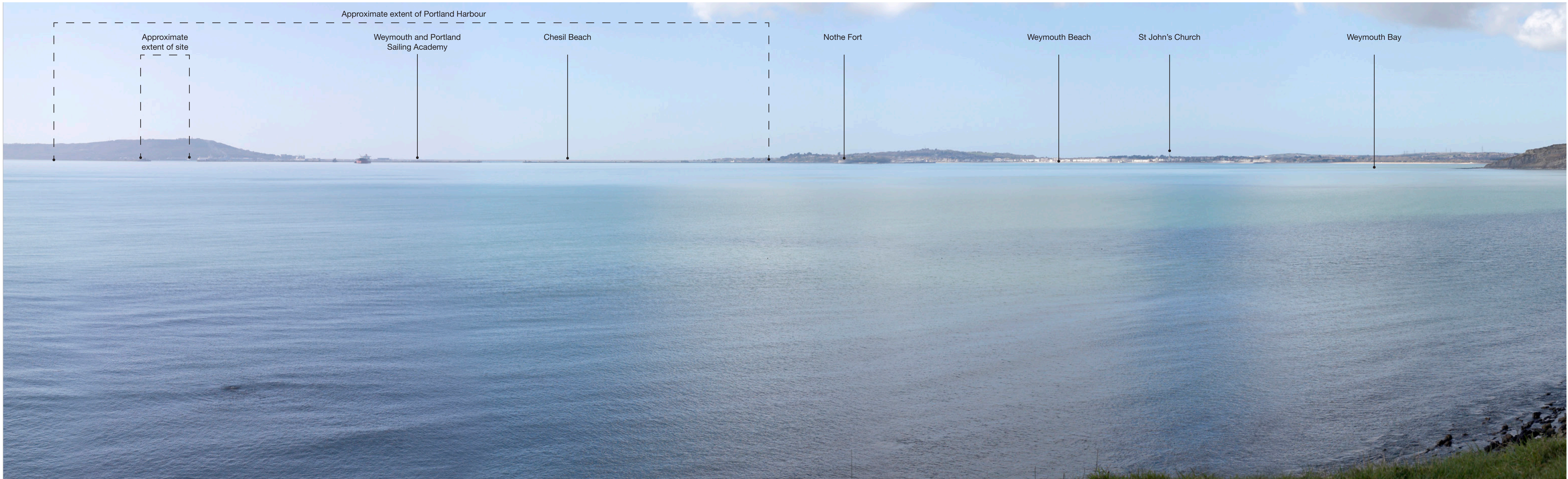
Taken from the car park at Osmington Mills Visualisation type 1. To be viewed at a comfortable arm's length and printed at A1