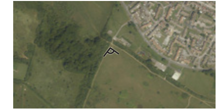
Figure 9.30 Viewpoint 13 winter